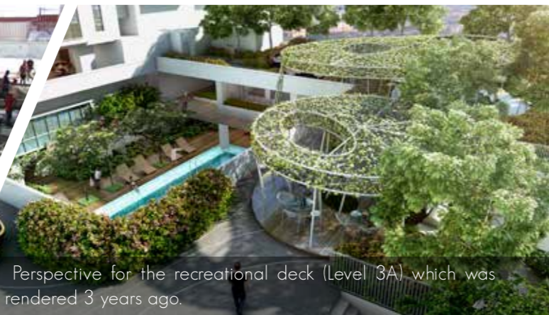
Perspective for the recreational deck (Level 3A) which was rendered 3 years ago.