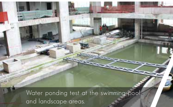
Water ponding test at the swimming pool and landscape areas.

BKP's construction team is working closely with appointed contractors and suppliers to ensure the progress of swimming pool and recreational deck goes smoothly.